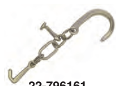
22-796161 Tie Down Keys w/ J Hook (Quantity of 4)