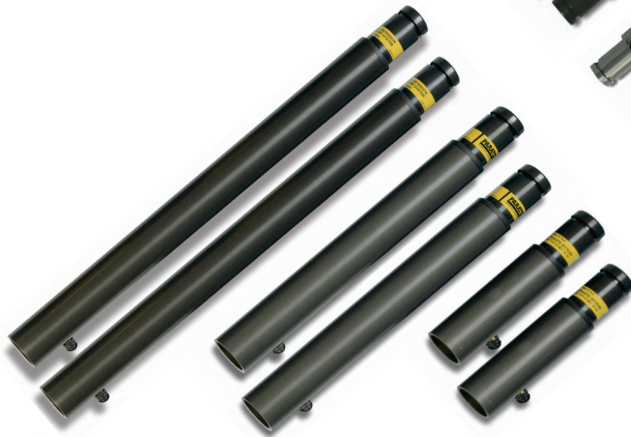
22-796036 Strut Extension 36 in (91 cm) (Quantity of 2)