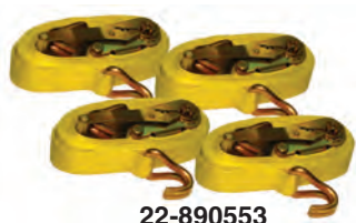
22-890553 Ratchet Belt w/Finger Hooks 27 ft (8.2 m) (Quantity of 4)