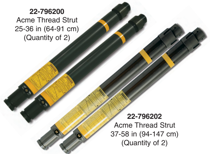
22-796200 Acme Thread Strut 25-36 in (64-91 cm) (Quantity of 2)