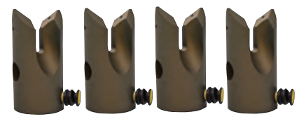
22-796025 Multi-Base (Quantity of 4)